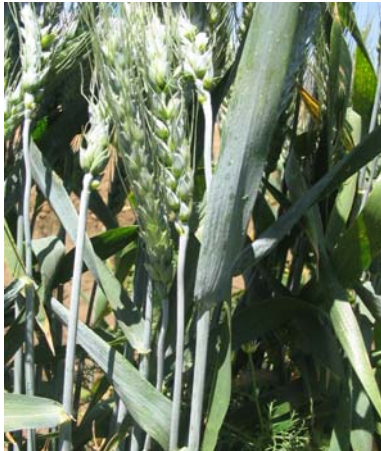
Figure 1. Wax in Patwin

Patwin is more similar to the two Hard White Spring varieties ‘Clear White’ and ‘Blanca Grande’ currently grown in California. The following characteristics can be used to differentiate Patwin from these varieties: