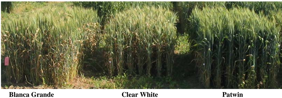
Figure 3: Comparison between Blanca Grande, Clear White and Patwin for leaf damage produced by stripe rust and Septoria Tritici Blotch, Davis May 8 2006

Patwin has high Loaf Volumes ( 910 \pm 11 cc), which are not significantly different from Blanca Grande ( 941 \pm 14 cc, P > 0.05 ) but that are significantly larger than those observed for Clear White ( 855 \pm 16 cc, P < 0.05 , see Appendix D, Table 7). All three varieties have similar flour extraction rates (Appendix D, Table 8).