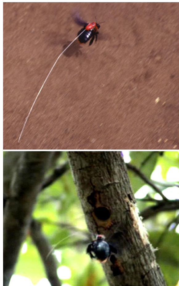
Fig. 3. Xylocopa flavorufa taking off (Upper) and returning to its nest (Lower).

If we consider the potential domesticated to wild cowpea gene flow, only one flight was between wild and domesticated cowpea (in the three recorded bouts, the field was the last place visited before returning to the nest). This ratio will increase slightly when wild plants are adjacent to domesticated cowpea fields, which is often the case in coastal Kenya. It should also increase much more in situations where wild cowpea plants are weeds