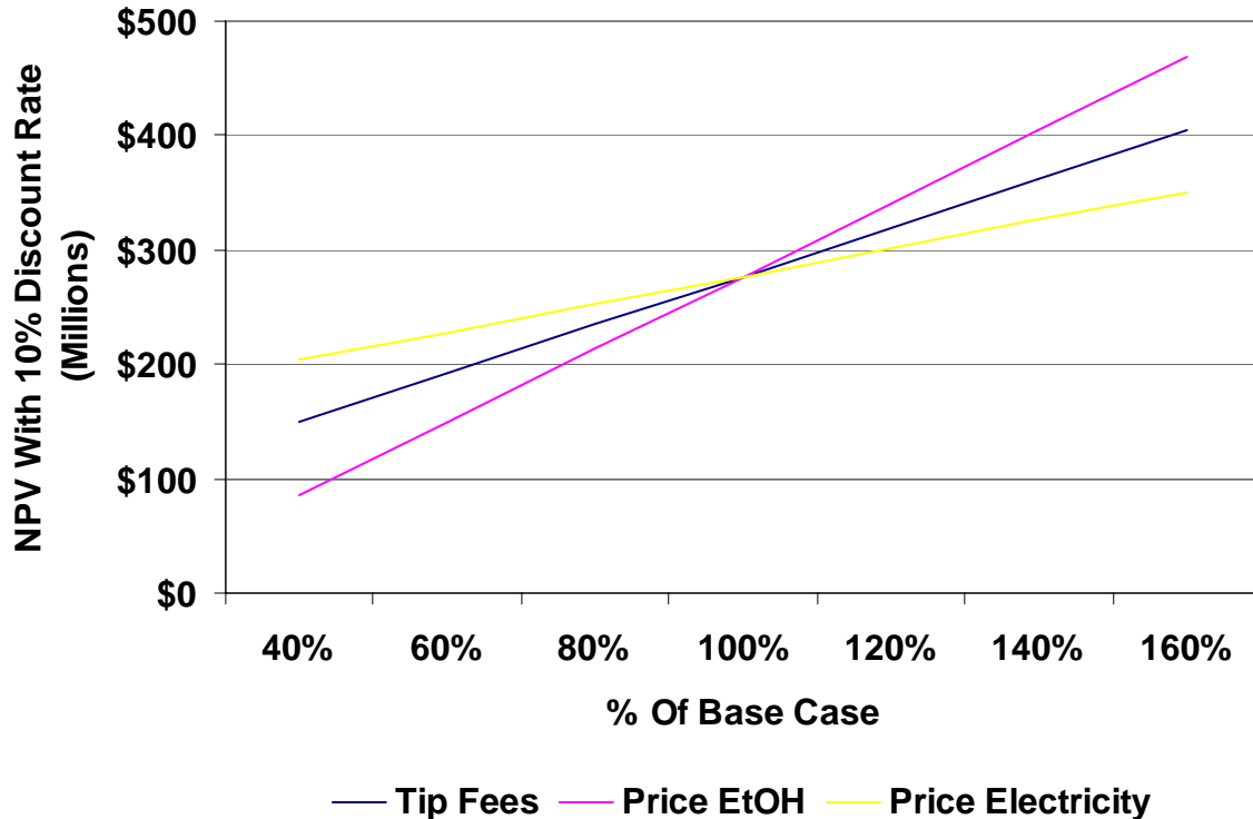
Figure 1. Net present value of a 3000 TPD MSW-based biorefinery with a 10 % discount rate. This economic model forecasts a process with no additional pretreatment (41 % hydrolysis rate).

Results have shown that utilizing autoclaved MSW with no pretreatment is an economically viable option even though only 40-50 % glucose conversion can be achieved. ( Figure 1 ) Liquid hot water pretreatment at temperatures of 215-225 °C however can enhance the % conversion of glucose to ~80 % yield and increase the volume of ethanol with only modest increases in energy requirements. Research also showed that glucose from unwashed MSW can be converted to ethanol at 80 % of theoretical yields indicating that inhibition of yeast activity is not an obstacle.